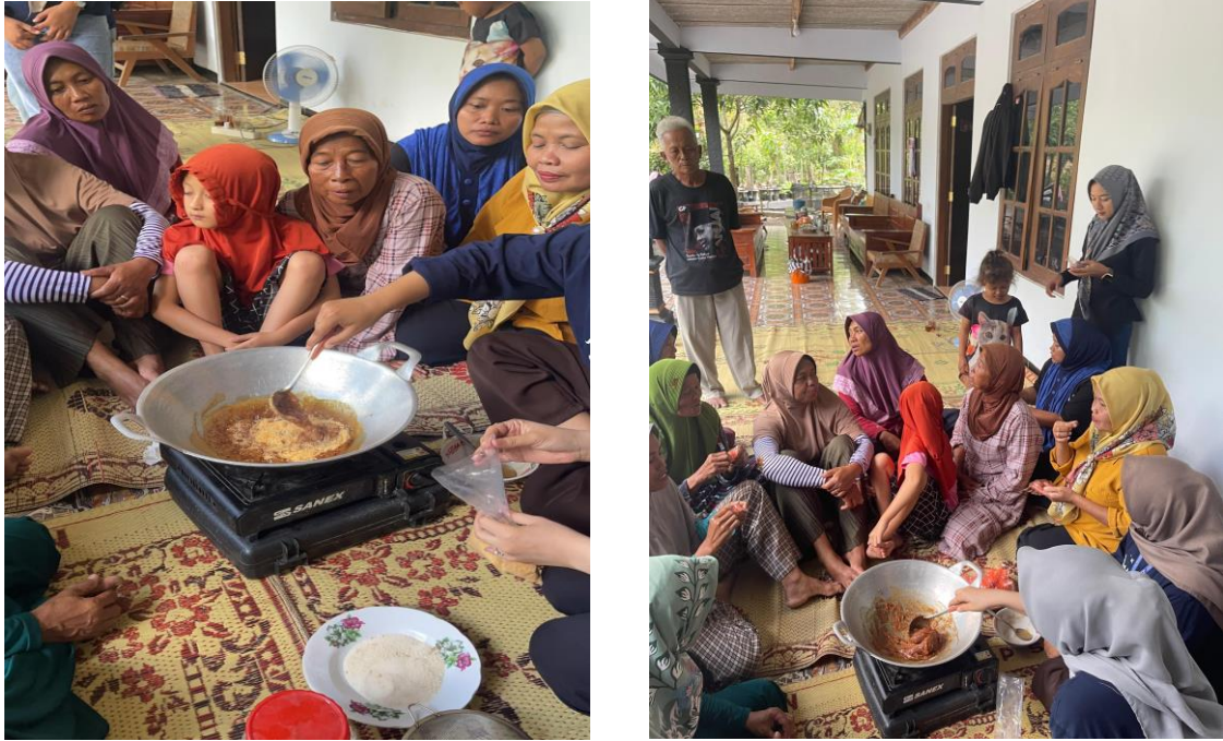
Figure 5. The practice of making sour candy

After implementing the activities, the implementation team evaluated to assess the program's success. The assessment is performed through interviews and questionnaires to measure the improvement in participants' skills, satisfaction with the training, and the potential sustainability of the businesses generated from this training. The evaluation results provide recommendations for improvements and necessary follow-up steps.