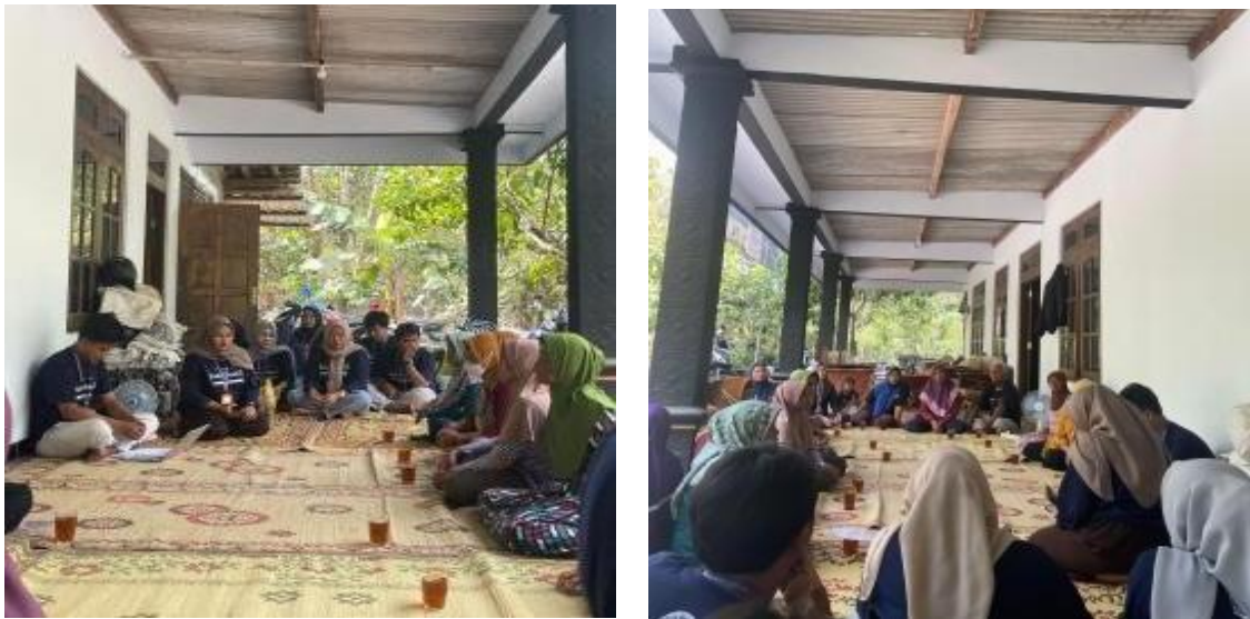
Figure 3. Documentation of activity preparation

This stage begins with coordination between the implementing team, Field Supervising Lecturers, and the community of Sengonkerep Hamlet to identify specific needs and determine the activity schedule. The implementation team also prepared training materials, such as soap base, water, tamarind, palm sugar, breadcrumbs, and granulated sugar, which will be used to make dish soap and tamarind candy. In addition, the team also provides supporting equipment such as containers, stirring tools, and cooking utensils.