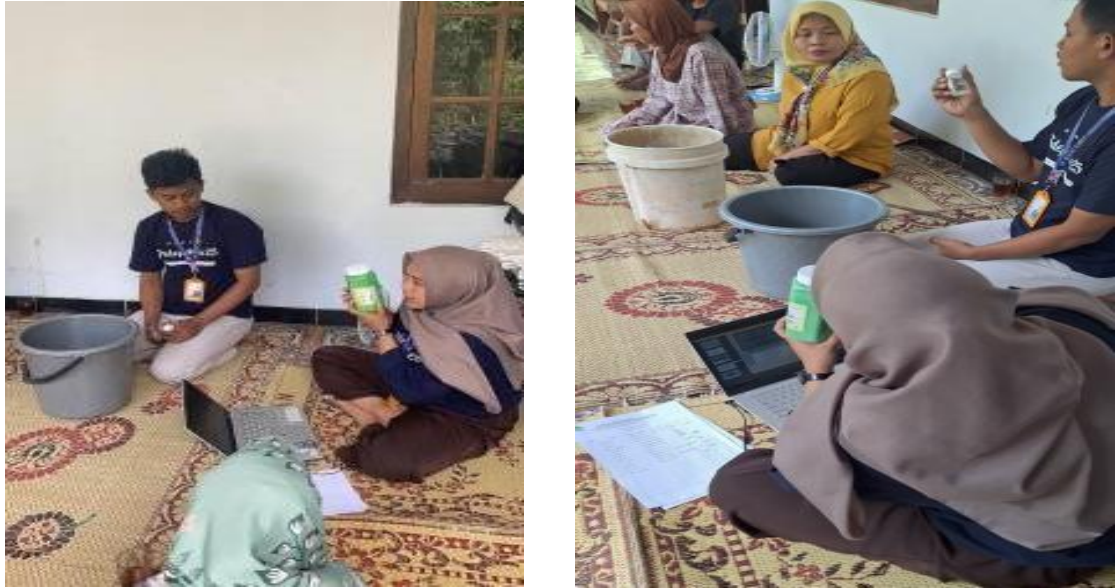
Figure 4. Presentation and introduction of the material