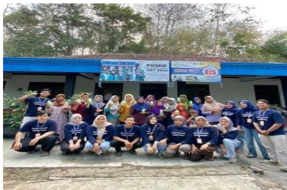
Figure 7. photo with the facilitator, implementer, and community