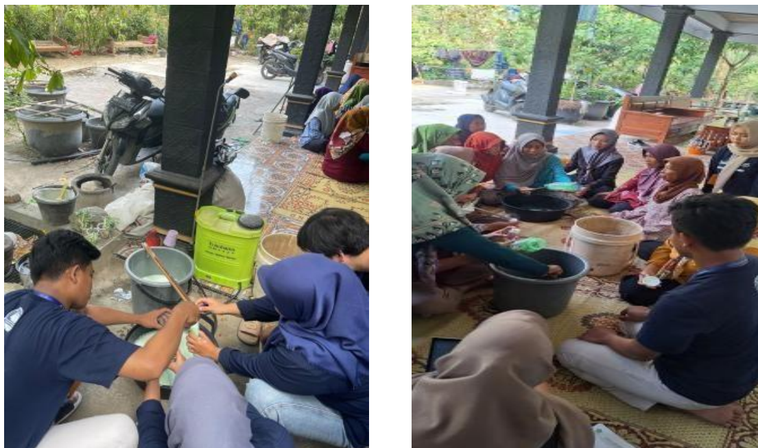
Figure 6. The practice of making dishwashing soap